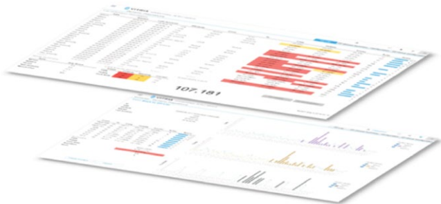
FIG.1: DYNAMIC POPULATIONS TEMPLATE

VIA's Dynamic Population Management solution enables operations teams to evaluate in real-time the performance of planned and unplanned change activities by correlating change events (e.g. new firmware deployment, new equipment, etc.) with detected operational anomalies (e.g. drop calls, defects, etc.). This lowers the overall time to resolve incidents and mitigates the associated costs. In addition, it allows organizations to evaluate change events that belong to a common initiative and assess overall performance (e.g. rollout of new equipment models). In a nutshell, VIA detects dynamic changes, evaluates their performance and facilitates the resolution of any related incidents.